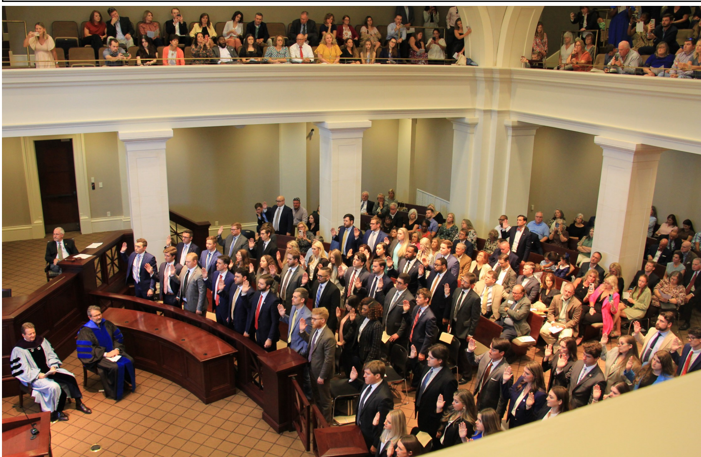
Lawyers take the oath to practice before the Mississippi Supreme Court at a ceremony on Sept. 28 in the En Banc Courtroom.

course of their lives. It may be their only time to be heard.”