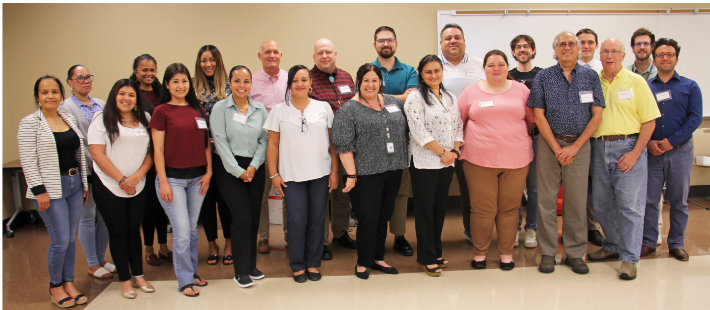
Eighteen class participants along with instructors and staff gathered for a photo during a break in an Ethics and Skills Building seminar for prospective court language interpreters in Jackson on Aug. 3. The class was the largest ever for AOC.

The 2023 Mississippi Legislature revised laws requiring qualified language interpreters for people of limited English proficiency in court proceedings to provide broader access to assistance for those who are limited in their understanding of English or who speak English as a second language.