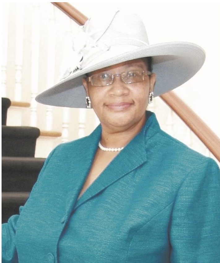
Hinds County Court Judge LaRita Cooper-Stokes

Hinds County Court Judge LaRita Cooper-Stokes died on May 8. She was 64.