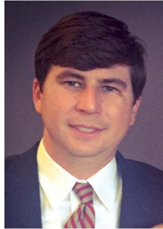
Judge Wes Ryals II